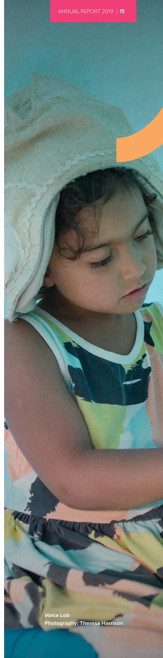
Voice Lab Photography: Theresa Harrison