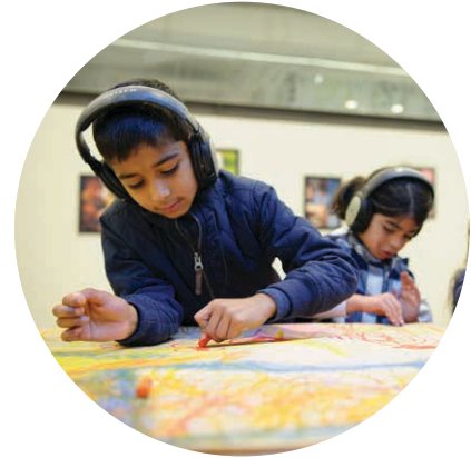
Sound of Drawing