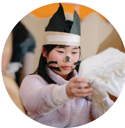
Cat City Photography: Ai Ueda