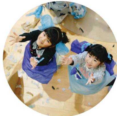
Paper Planet Photography: Ai Ueda

Polyglot's workshop program engages with schools, festivals, events and communities nationally and internationally, offering children a structured opportunity to discover their imaginative potential.