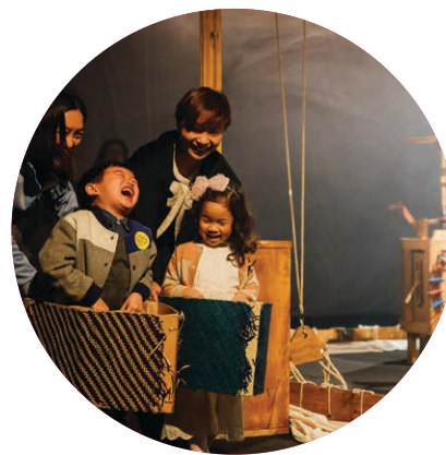
Cerita Anak (Child's Story)