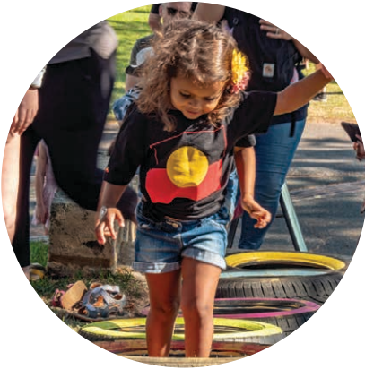
Manguri Wiltja Photography: Bewley Shaylor