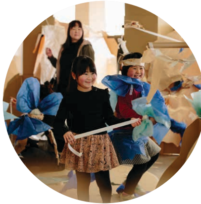
Paper Planet Photography: Ai Ueda