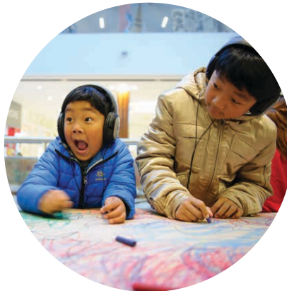
Sound of Drawing Photography: Sarah Walker